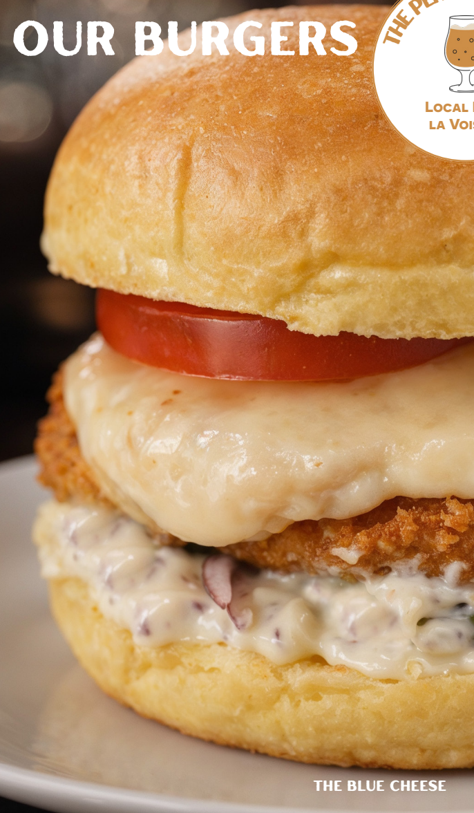
THE BLUE CHEESE