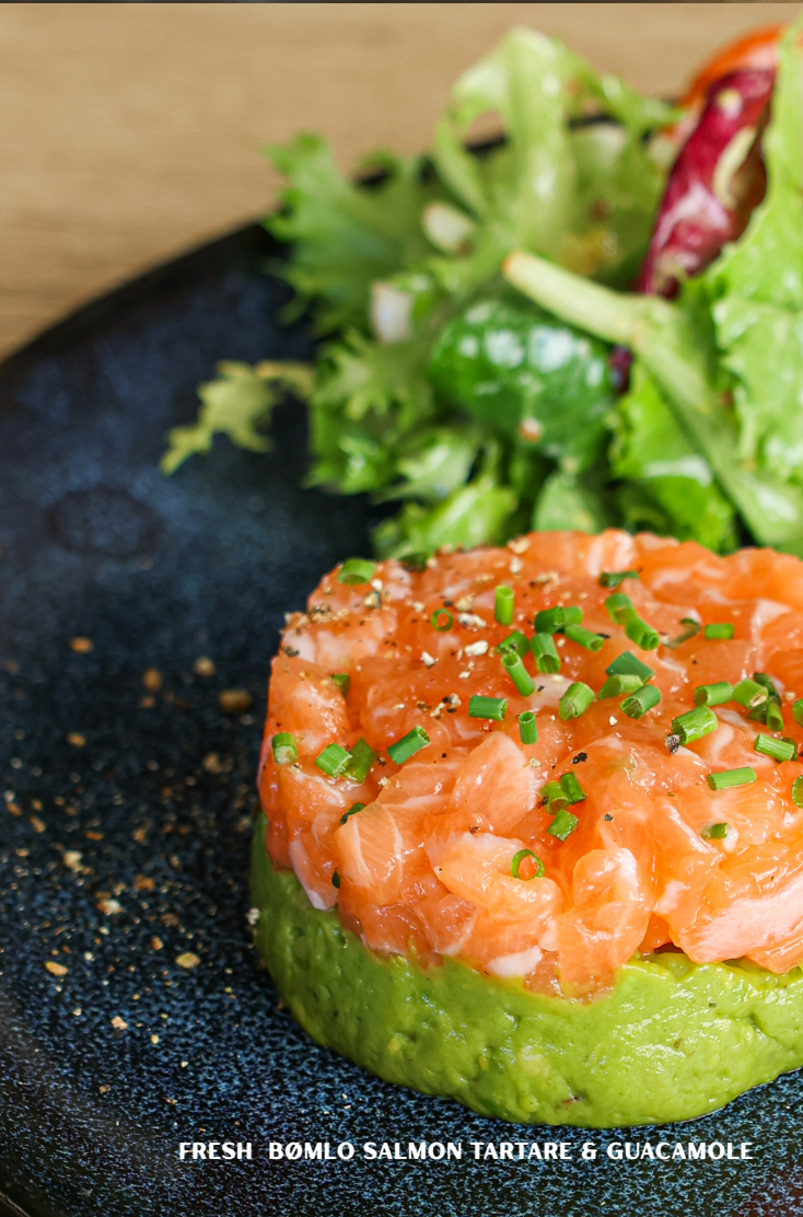
FRESH BÖMLO SALMON TARTARE & GUACAMOLE