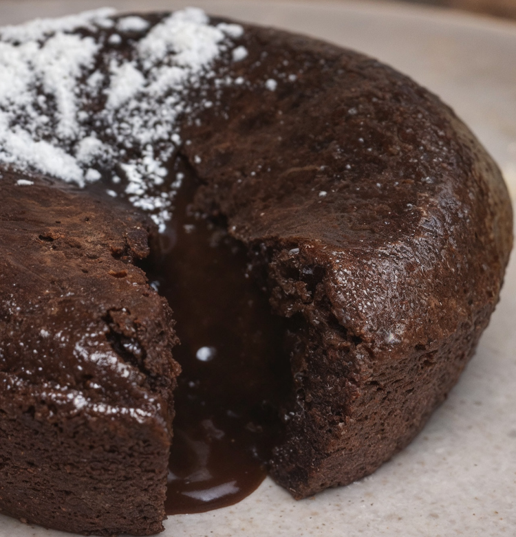
DARK CHOCOLATE LAVA CAKE